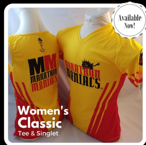
Women's Classic Tee & Singlet