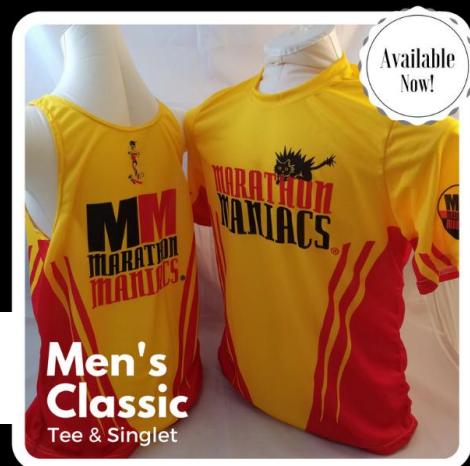
Men's Classic Tee & Singlet

http://www.databarevents.com/store/ category/1/Marathon-Maniacs