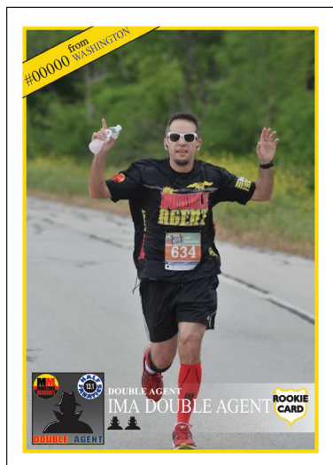
Front of card