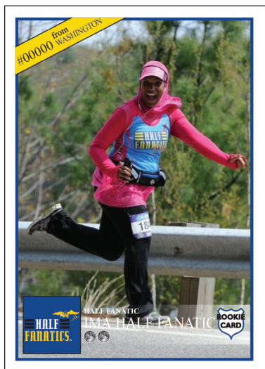
Front of card